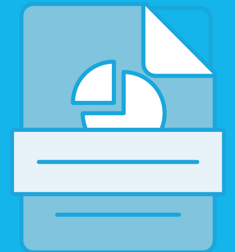
Monthly or quarterly Excel Reports