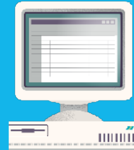
Desktop (offline) accounting software